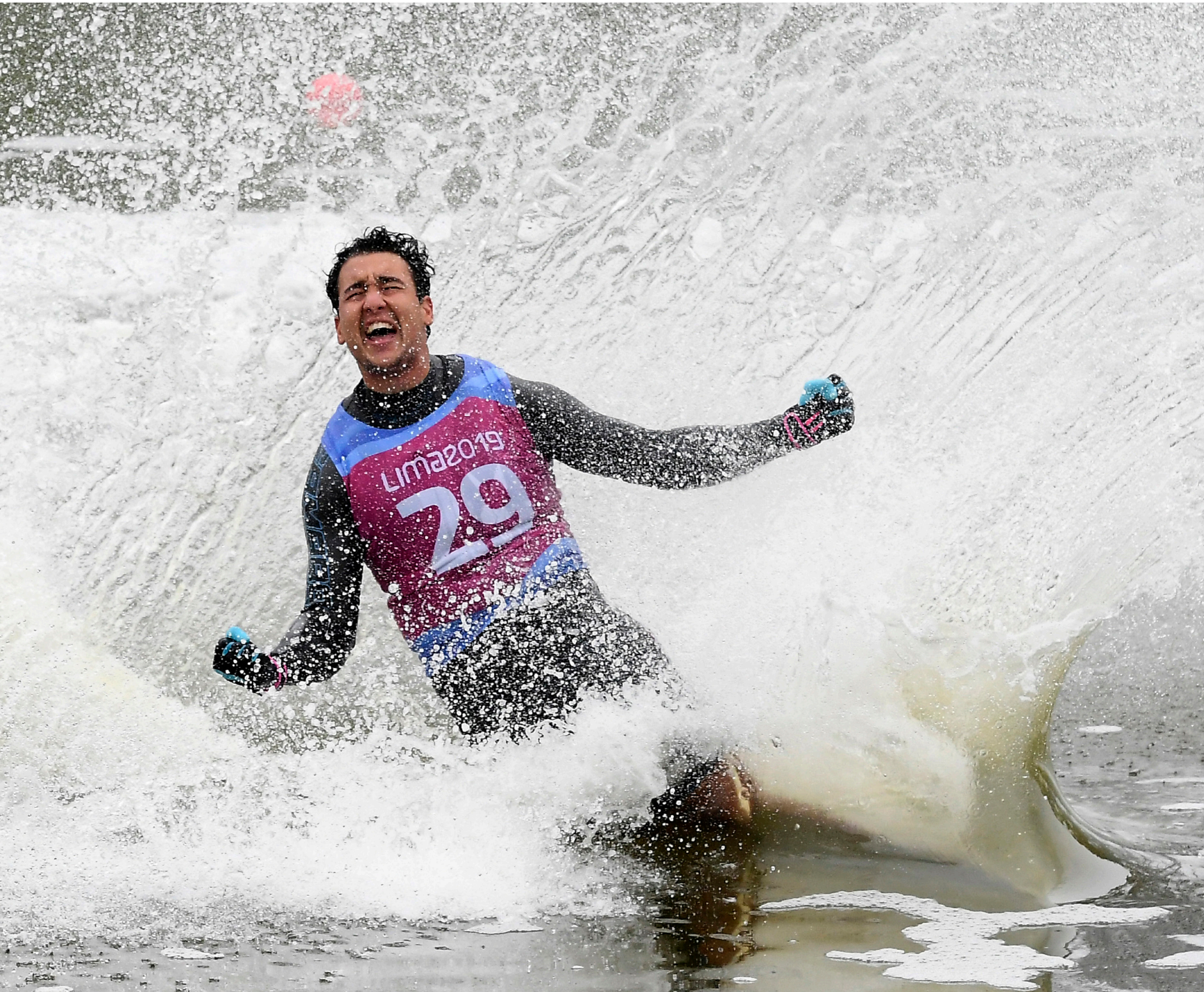
Photo: Manuel Jiménez Dominican Republic Hoy y Vespertino El Nacional