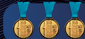
LIMA 2019 Pommel Horse / Horizontal Bar / Team