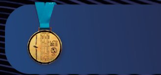
LIMA 2019 Tricks