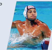
Tony Azevedo (USA - Water Polo) Havana 1999, Santo Domingo 2003, Rio 2007, Guadalajara 2011, Toronto 2015

"It is an honor for me to be part of the Athletes Commission representing Mexico, to be able to see and look for ways to always be growing the Pan American sport nationally and worldwide. I think the prettiest part of the sport is meeting people who have that winning, committed, disciplined, persevering spirit."