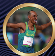
Alison dos Santos