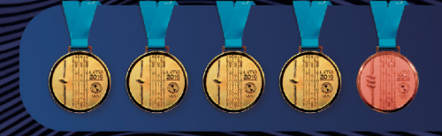
LIMA 2019 Most Decorated Athlete of Lima 2019 All-Around, Ball, Hoop, Ribbon