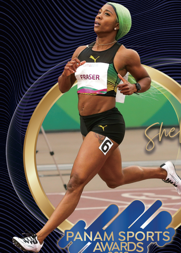
Shelly-Ann Fraser-Pryce Athletics - 200m