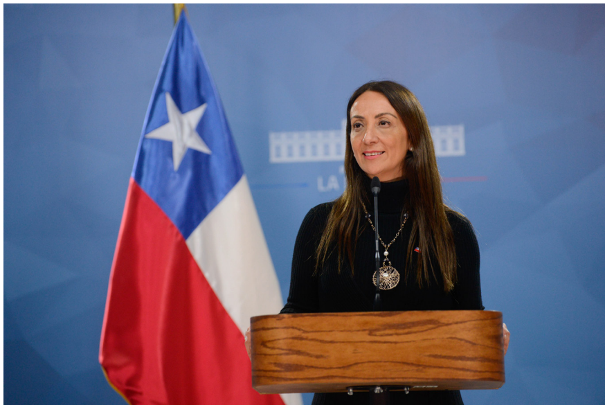
Cecilia Pérez, Minister of Sports of Chile