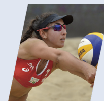
Melissa Humana-Paredes (Canada - Beach Volleyball) Toronto 2015

"As a two-time Olympian, I take pride being really involved with the Athlete Commission in Brazil so I decided to run for the Panam Sports Athlete Commission to give me even more experience helping athletes throughout the Americas."